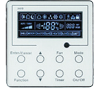
THERMOSTAT (Included) MC20700140 (XK19)