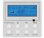
THERMOSTAT (Optional) XE71