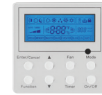
THERMOSTAT (Optional) XE71