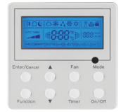
THERMOSTAT (Optional) XXK60