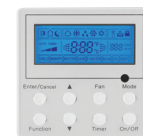
THERMOSTAT (Optional) XE71

Wi-Fi MODULE AVAILABLE TL127000600_L72279