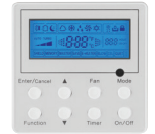
THERMOSTAT (Optional) XE71