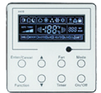
THERMOSTAT (Included) MC20700140 (XK19)