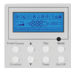
THERMOSTAT (Included) XE71