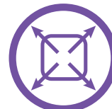
Purifies up to: 4,000 sq.ft.