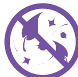
Eliminates volatile organic compounds (VOCs)